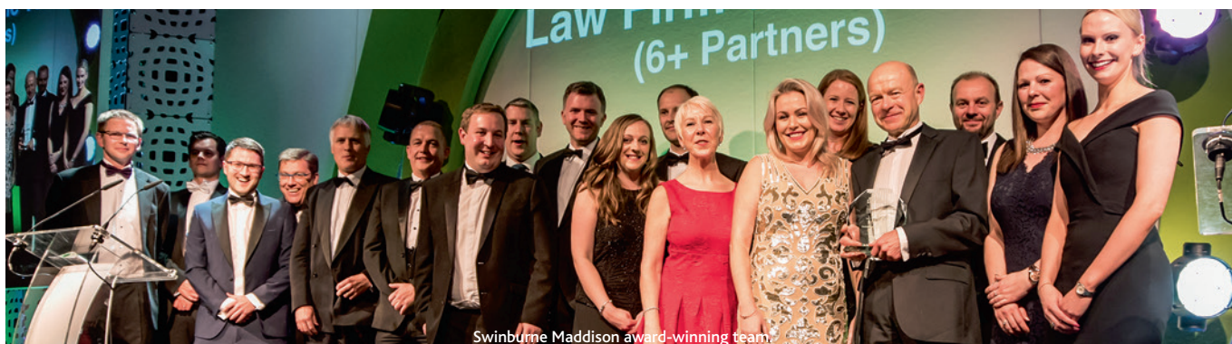
Swinburne Maddison award-winning team

Since its creation in 1998, Swinburne Maddison LLP has undergone significant change and development and has now been named winner in two categories at the recent Northern Law Awards – Law Firm of the Year (6+ Partners) and Team of the Year – Litigation and Dispute Resolution.