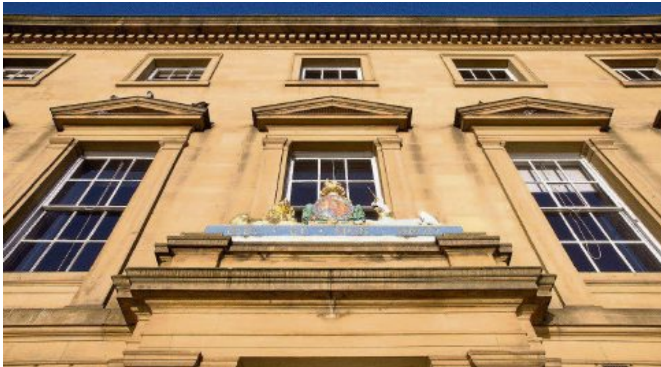
► Trinity Chambers in Newcastle