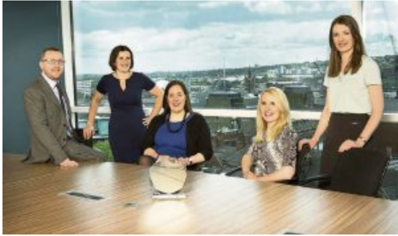
➤ DAC Beachcroft's Newcastle Real Estate team