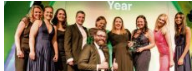
► The team from TLW Solicitors – Winners of Employer of the Year

"This award recognises the continued self-improvement and learn-