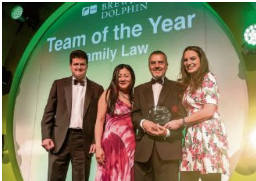
➤ Beecham Peacock was crowned Team of the Year in Family Law at this year's Northern Law Awards

Beecham Peacock is already widely recognised as one of the North East's most renowned firms. This year alone, the firm has scooped the top prize for Team of the Year in Family Law as well as being named finalists in Personal Injury/Clinical Negligence, Employment and Lawyer of the Year categories. This large number of categories illustrates the outstanding dedication & commitment of the teams and shows that Beecham Peacock, and their Family Law team, will continue to grow.