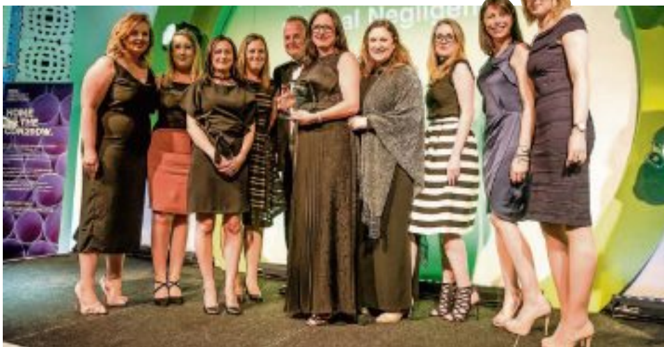
► The North East offices of national law firm Irwin Mitchell are celebrating more success after winning three awards